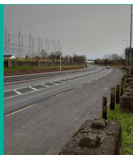
Moneen Road Active Travel Scheme 2021