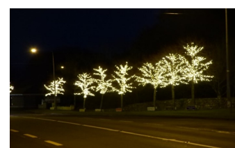
Ballyheane Christmas Lights