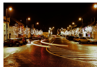
Balla Christmas Lights