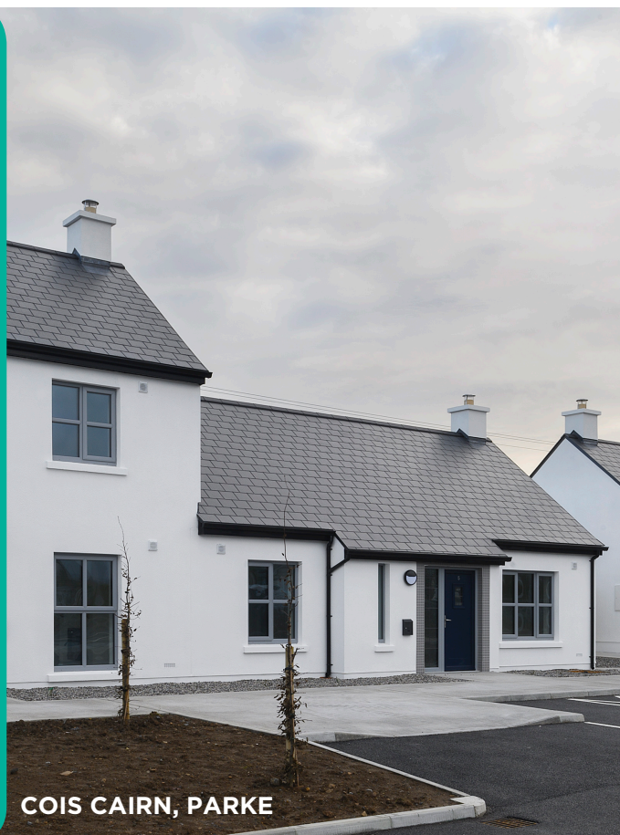
COIS CAIRN, PARKE