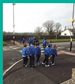
Mayo Abbey Paths - Safe to Schools Programme Works funded by the NTA 2020 & 2021