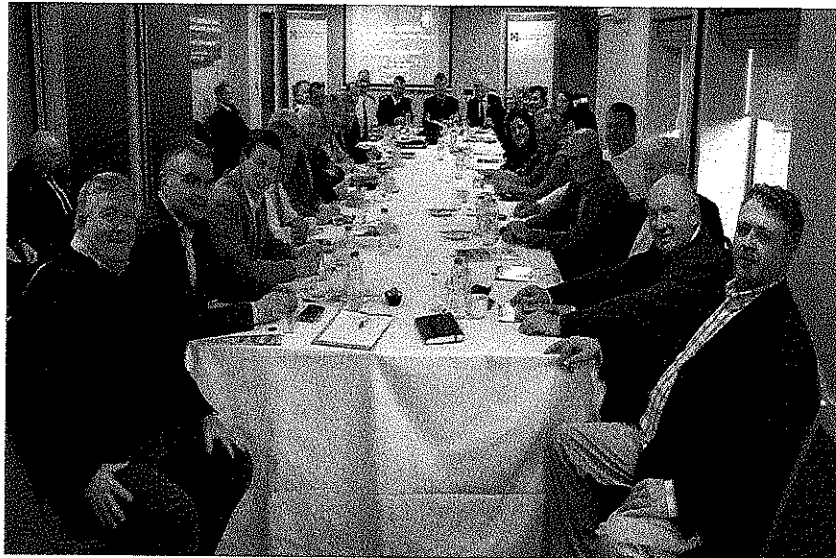
Members of Mayo JPC