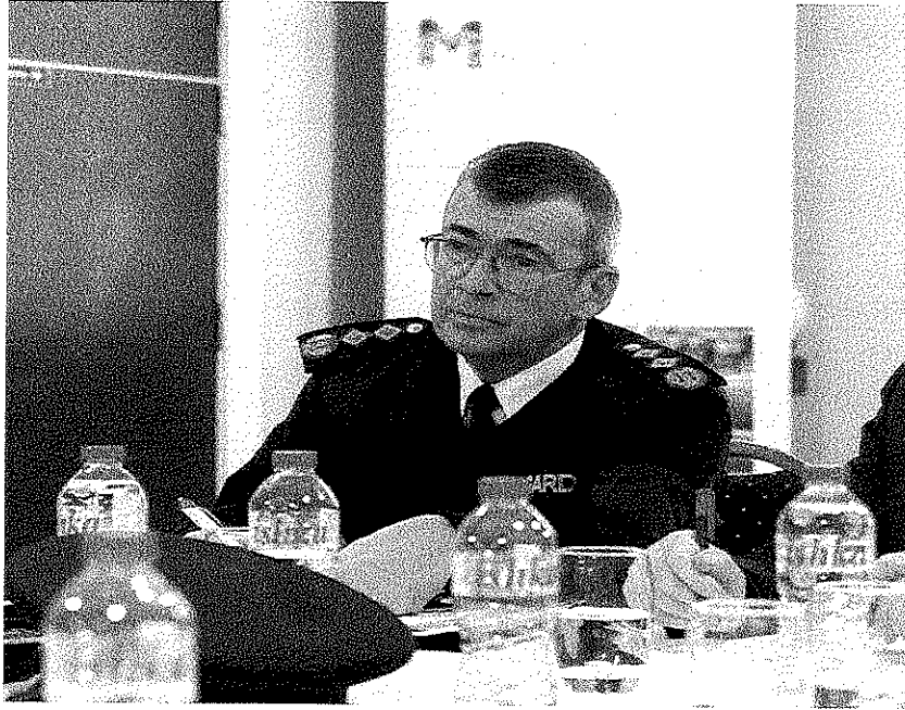
Commissioner Drew Harris at a meeting of the Mayo JPC 8 th November 2019